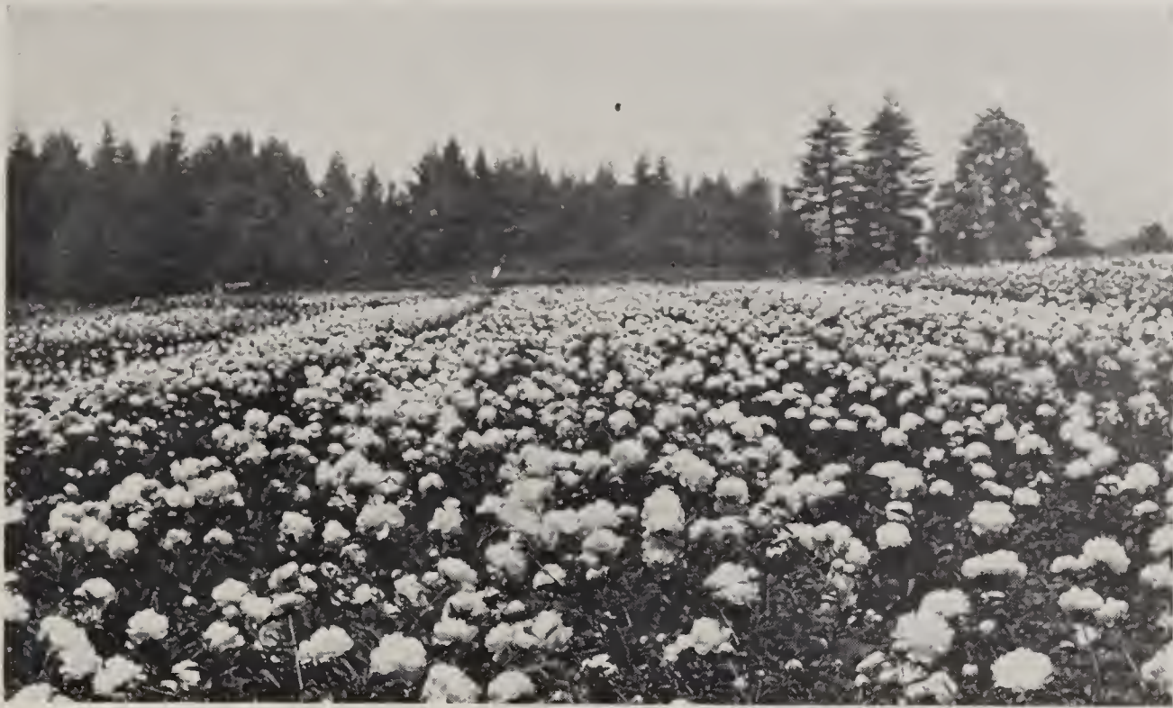
A Portion of Our Planting at Blossom Time